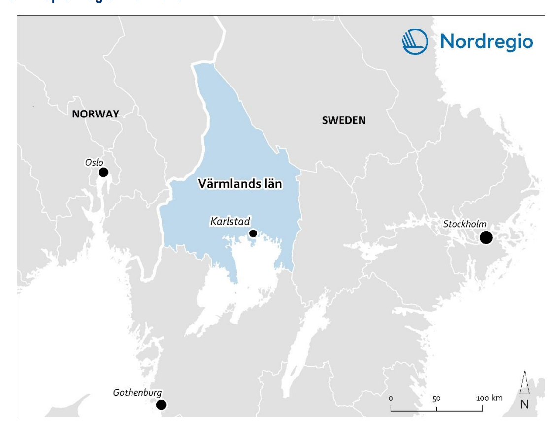
Figure 2. Map of Region Värmland

Värmland is located in Norra Mellansverige (North Middle Sweden) and has a population of approximately 280 000 inhabitants. More than a third of the county's population live in the main city, Karlstad. Karlstad is about 300 km from the capital Stockholm in the east, with which most of its economic activities are connected, and 250 km from Gothenburg to the south. Today, Värmland holds close ties with Norway – the country's most important trading partner, and its capital region, Oslo, which is 250 km to the west. More than 5 400 people from Värmland commute to Norway to work on a weekly basis, and these figures keeps increasing, and this figure is much higher at a national level. According to the findings of Region Värmland reports from 2015, about SEK 11.5 billion (ca EUR 140 million) of Swedish residents' income are earned across the border, which underestimate the real figures of employment and income for Värmland. In turn, many people from Norway travel to Värmland to shop or to live while maintaining a regular cross-border commute, which has in the past few years generated approximately SEK 4 billion annually (ca EUR 360 million) for involved business industries and stakeholders.